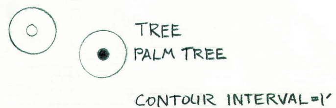
LAYOUT PLAN QUADRANT 2E