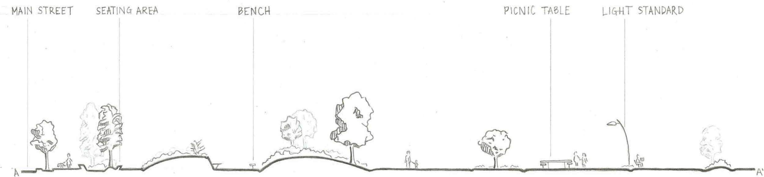
SECTION ELEVATION IN